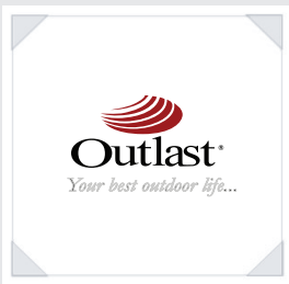
OUTLAST Moderate Temperature