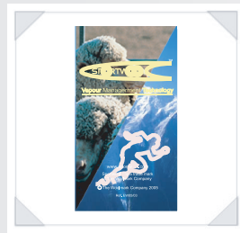
SPORTWOOL Eco-Friendly, Anti-Pilling