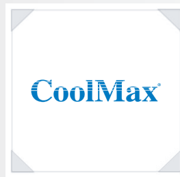
COOLMAX Quick Drying