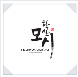
HANSAN MOSI Eco-Friendly