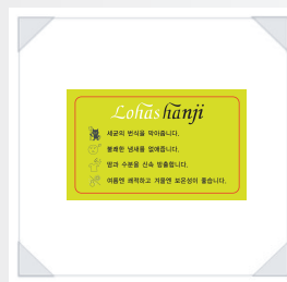
LOHAS HANJI Eco-Friendly