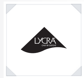
LYCRA Stretch Fabric