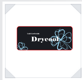
DRYCOOL Quick Drying