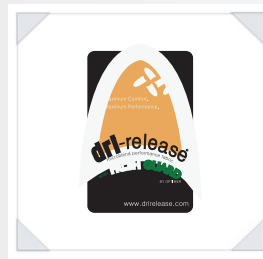
DRI-RELEASE Quick Drying